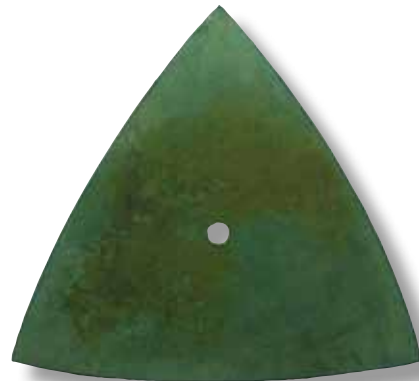
Red wine vinegar on brass, 18 hours.