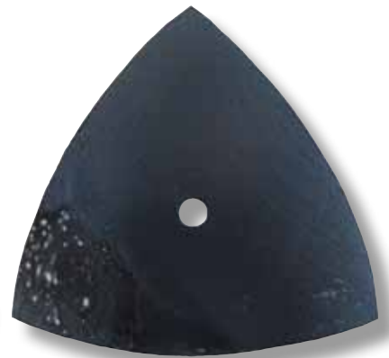
Ammonia fumes on brass; 24+ hours.