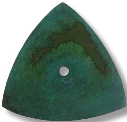
Ammonia fumes on copper; 24 hours.