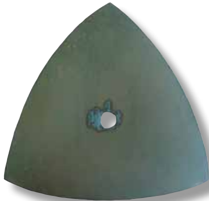
Ammonia fumes on copper; 12 hours.