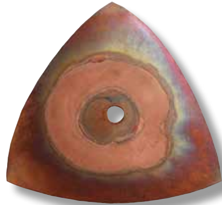
Mustard on copper, sealed under a container to fume for 24 hours, removed with hot water.