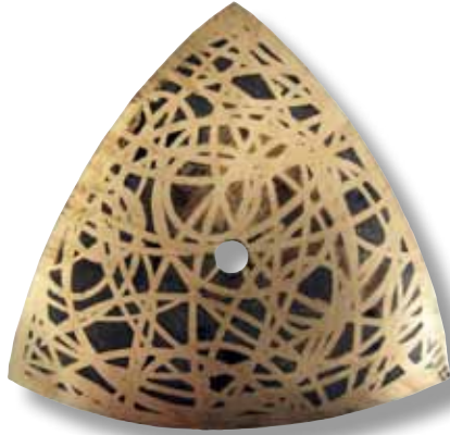
Sharpie ink on brass, colored with gun bluing, removed with acetone.