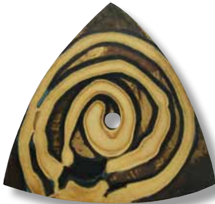
Sugar icing on brass, colored with gun bluing, removed with hot water.